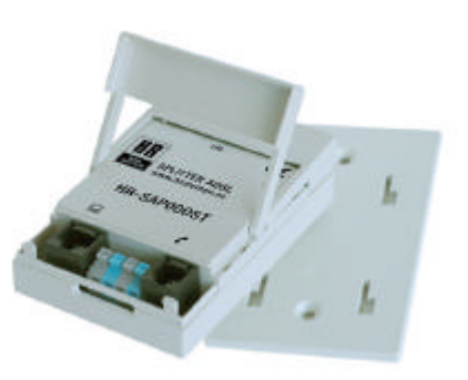
Two connection options

The ADSL splitter must be placed in the entrance line point before any other equipment from the internal network. Fixing: With a plastic holder and 2 screws.